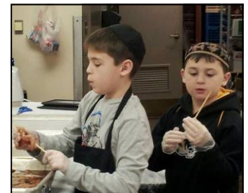
Future Beth El Men's Club members help prepare for the Chinese Buffet.

Yellow Candle Project - To commemorate the Holocaust and to memorialize its victims. Funds raised support Beth El youth projects. ≈