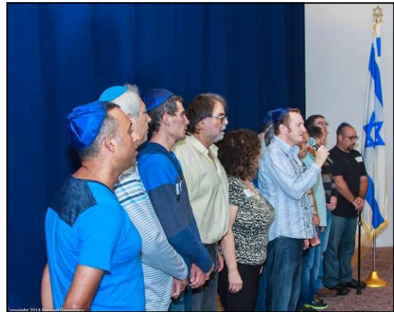
Veterans lead Hatikvah