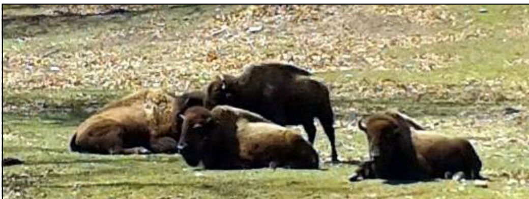
Buffalo taking a break at Lone Elk Park, St. Louis County, Mo.