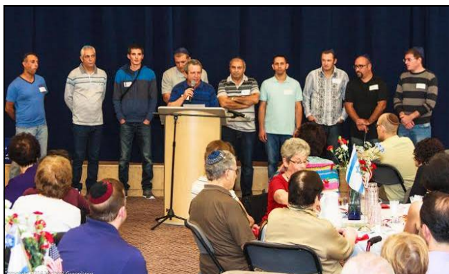
Veterans' presentations to attendees

American Friends of Israel War Disabled Foundation hosts Israeli disabled veterans each year for a period of rest and rehabilitation to expand ties between Israel and the Chicago Jewish community metropolitan area and support Israeli disabled veterans and victims of terror attacks. ≈