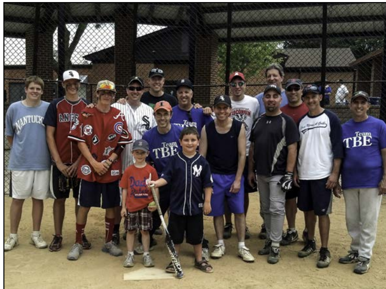
Beth El Israel Ner Tamid Men's Club Softball Team