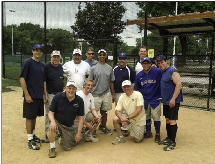
Congregation Beth Shalom Men's Club Softball Team