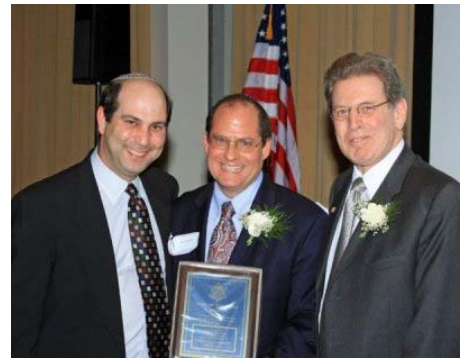
Scene from a previous Man of the Year event